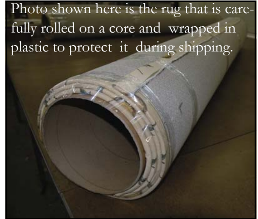
Photo shown here is the rug that is carefully rolled on a core and wrapped in plastic to protect it during shipping.