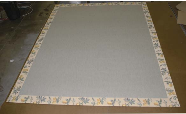
Photo shown is a rug laying flat immediately after production and prior to packaging and shipping.